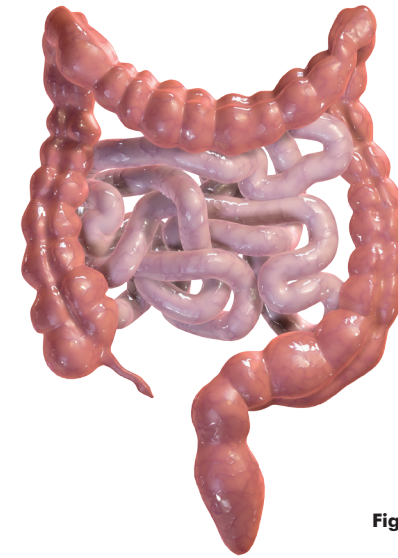
Fig. 1: Healthy Digestive Tract

Though you may have been taught to believe otherwise, you can begin taking responsibility for your own health today and live a long, happy and environmentally GREEN life.